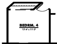
BEDROOM 4 OPT.